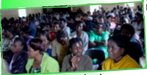
Some of the women gathered for the health seminars.

Our second week we spent in Kampala, Uganda where we had an amazing time! About 300 ladies from the islands (about a 2 hour journey by boat from Kampala) had gathered for health and education sessions. There is an extremely low literacy rate for people living in this