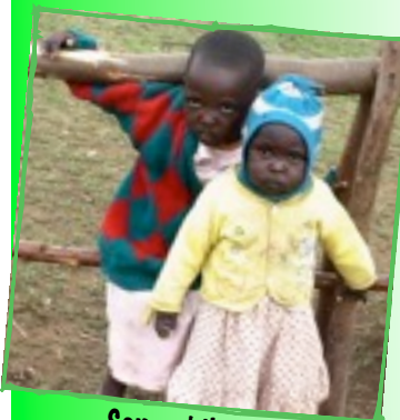
Some children of the community.

Once again, Eagles Wings can return home from Africa knowing that more lives have been changed and even rescued with the help and support of faithful individuals, schools, businesses, clubs and organisations. The more often we go back, the more I am encouraged that there are so many testimonies of restored hope and rebuilding of devastated lives that we haven't yet heard. We cannot expect that desperate situations will change in an instant, but that is why we are in it for the long run, and that is what makes us different.