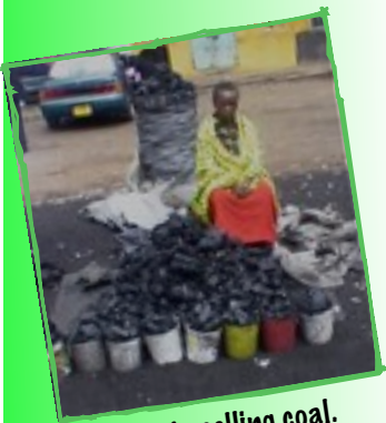
Lady selling coal.