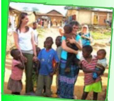
Children from Katwe slum.

We visited the school in Katwe Slum. It is doing really well and they have been able to take in more children. The teachers of the school get a very low wage, but love the children they are teaching and are very grateful to even have the opportunity. A school in England who are supporting Eagles Wings, raised money by having a dress down day which paid one teacher's salary for 3 months.