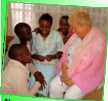
Sheena of EW team with girls from our Girls' Home.